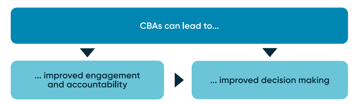
Figure 1: Purpose of CBAs